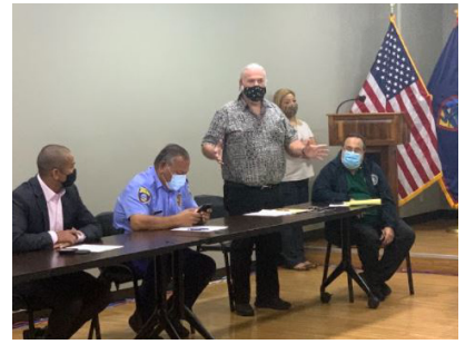
The OAG strives to increase transparency and works to finalize procedures for the handling of officer involved incidents.