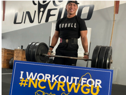
The OAG used technology to host its first-ever virtual fitness challenges to commemorate National Crime Victims' Rights Week in April, pictured above and below