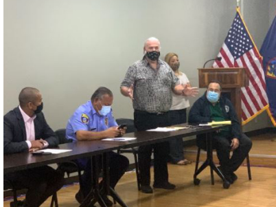
The OAG strives to increase transparency and works to finalize procedures for the handling of officer involved incidents.

Our team will continue to be called on to adapt to an environment that is increasingly reliant on remote access and electronic data. We will need to build on our ability to receive, organize, and store digital information. We will need to learn to communicate with the court, stakeholders, and our clients through the use of online technology.